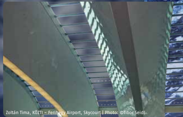
Zoltán Tima, KÖZTI - Ferihegy Airport, Skycourt